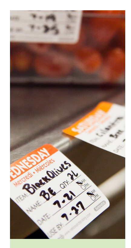
RIDU2201-07R Labels shown on page 7.

Top Reasons You Should Use NCCO's Food Safety Labelling System